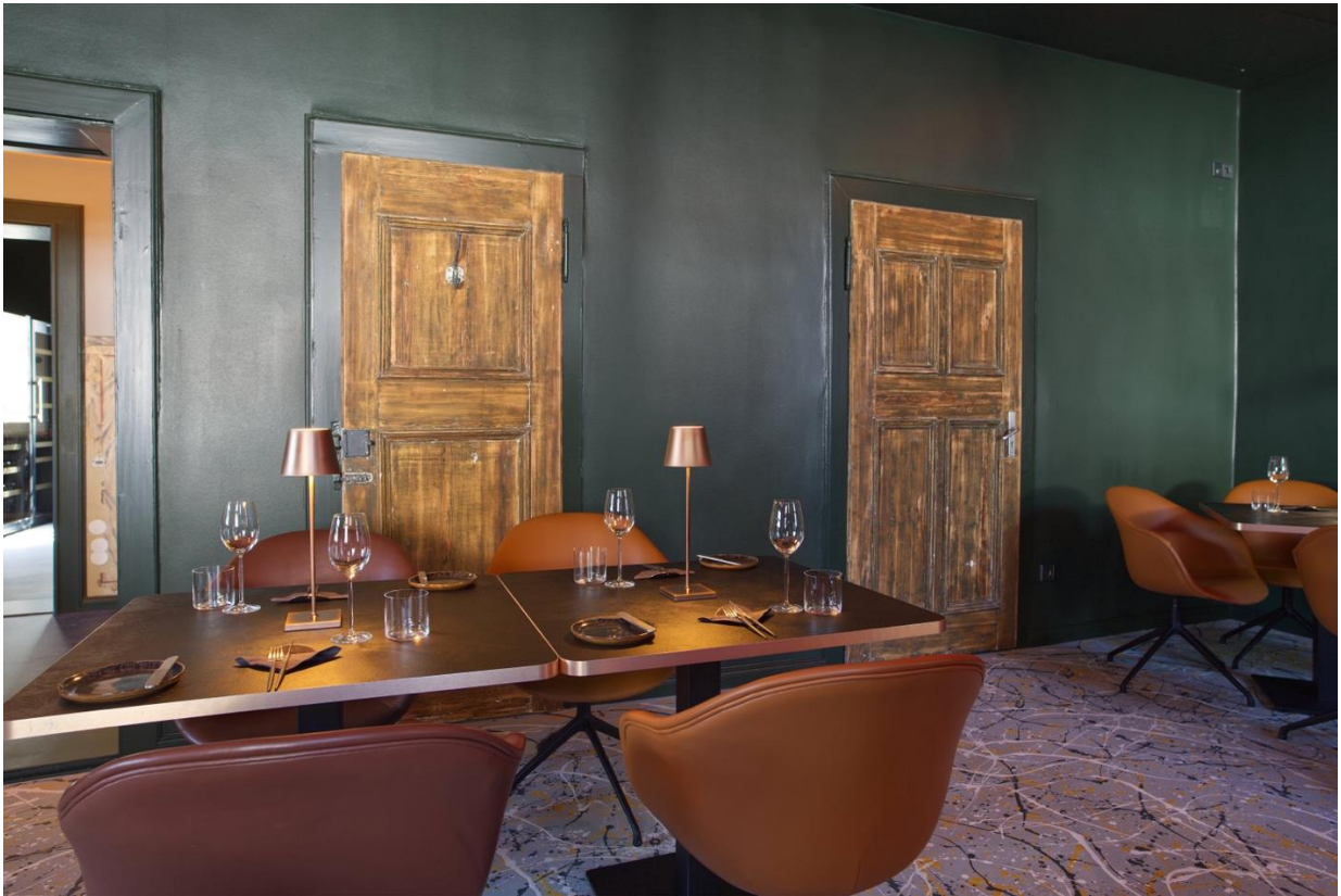
Above: The walls of the restaurant are lined with doors reminiscent of cell doors. Below: The rough-hewn walls of the former cells, which have been left in their original state. There are plans to convert this space into an accommodation facility in the future