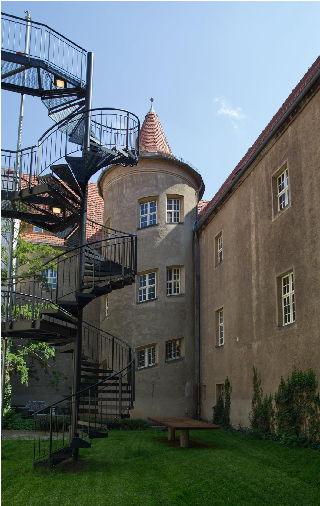
Above: The prison courtyard, where the original ping-pong table remains. A spiral staircase, added during the renovation, mirrors the design of the tower at the back.