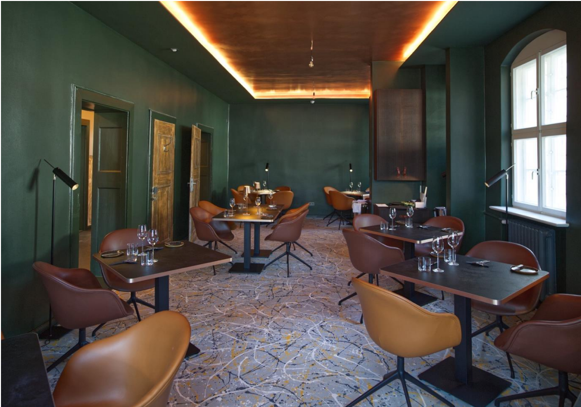
Above: The restaurant space with a remodeled entrance. Folded ceilings and indirect lighting create a sense of spaciousness in what would otherwise be a confined and oppressive area. Below: A space lined with cells, now repurposed as ateliers.