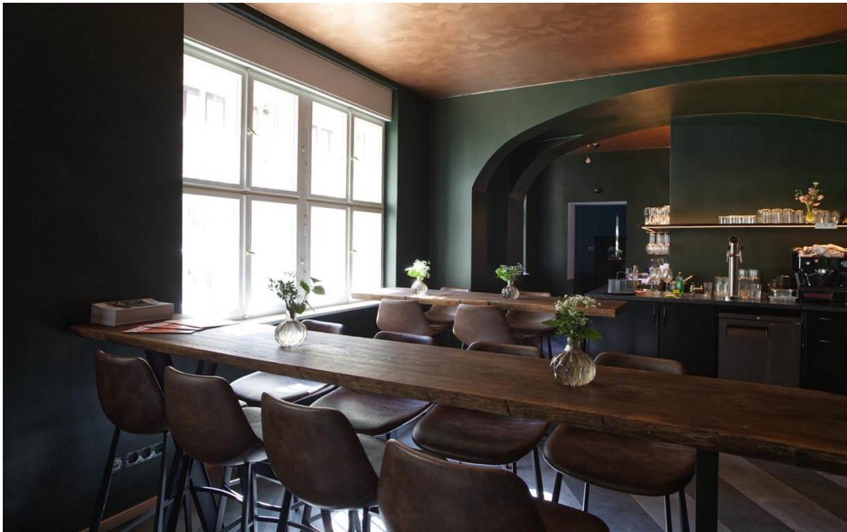
Above: The wooden counter and copper-plated ceiling create a warm, cozy atmosphere. Bottom right: In contrast, the cell space feels dull and cold. Each cell measures approximately 3.5 x 2.5 meters. Bottom left: The impressive building features a luxurious facade that blends seamlessly with the surrounding mansions. A courthouse stands in front of the prison.