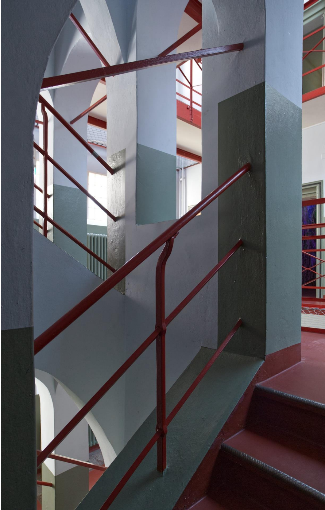
Above: The key colors of the prison space are green-gray and red, which also serve as the primary colors in the restaurant's interior design. The architecture is minimalist and functional, evoking the style of the early 20th century and Bauhaus.